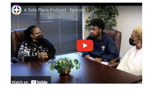
Watch Episode 1

california partnership to end domestic violence